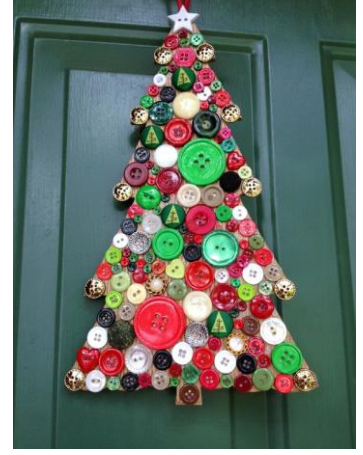
Button Christmas Tree $30