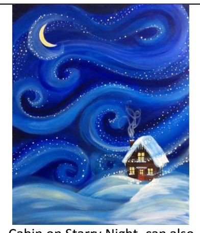
Cabin on Starry Night, can also be painted with lights behind it.