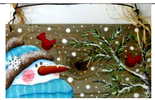
Snowman & Cardinals on Wood with wire hanger. Somewhat detailed $34