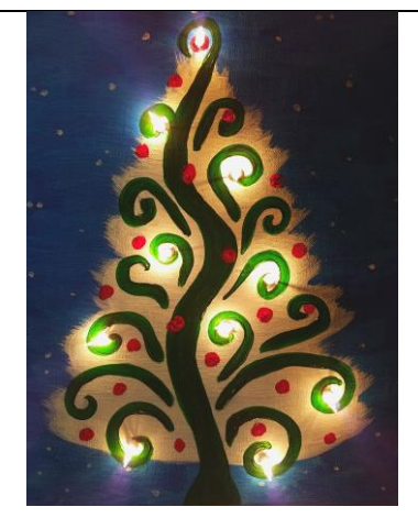
White Whimsical Holiday Tree with Lights $32