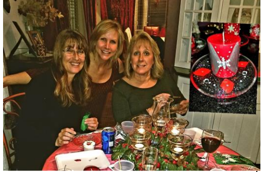
Christmas Candle & Plate Very Easy Project