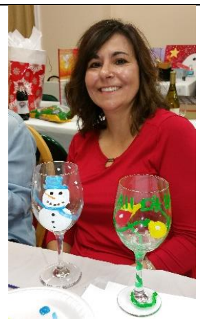
Holiday Wine Glass $22 each