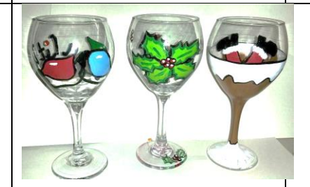
Wine, Beer Drinking Glasses Available. Each $22 Very Easy to create, many templates!