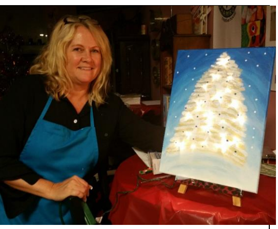
Blue Tree or Green Evergreen, all 3 are the same project $32