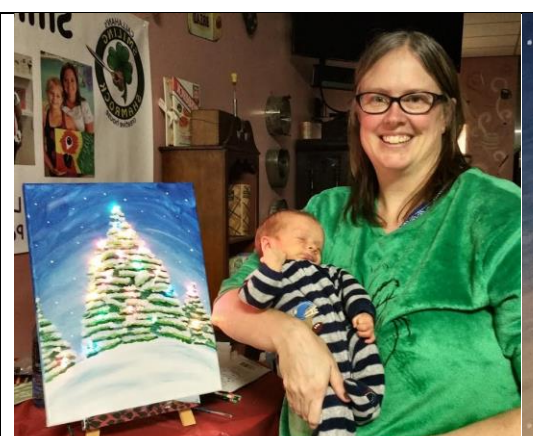
Light Up Christmas Tree on Stretched Canvas, can be painted with $32 or (without lights $28).