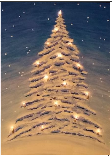
Blue Green and White Christmas Tree $32