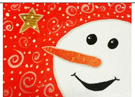
Snowman with Red sky & Gold Star and Glitter Paint. $28 each Great Family Favorite