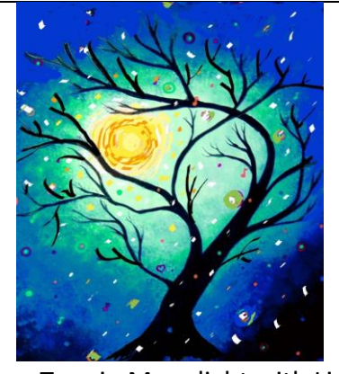
Snowy Tree in Moonlight with Lights $32