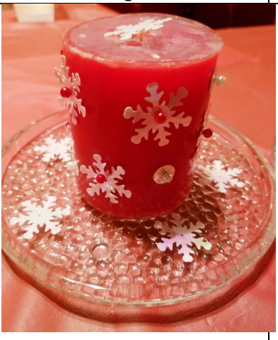
Candle & Plate, you can paint and decorate both. $18 each candle/plus plate