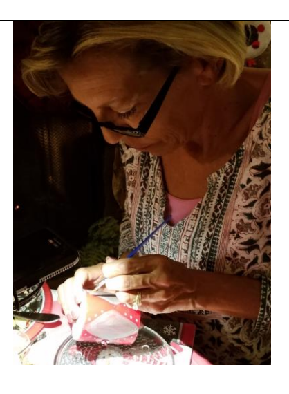
Painting Candles, most economical project we have!