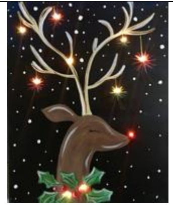
Holiday Reindeer with Lights $32