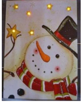
Snowman with Star in Hand With Lights $32