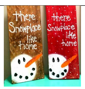
Snowman, No Place Like Home painted on Wood $32