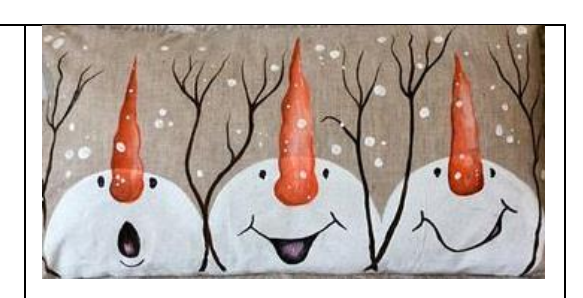
Three Carrot Snowmen with Lights $32