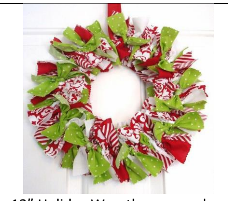
12" Holiday Wreath, many colors $32