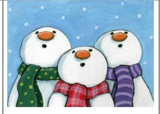
Three Snowmen with Lights on stretched canvas $32