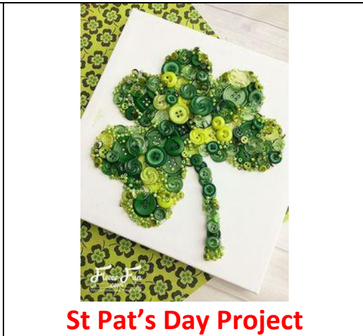
St Pat's Day Project