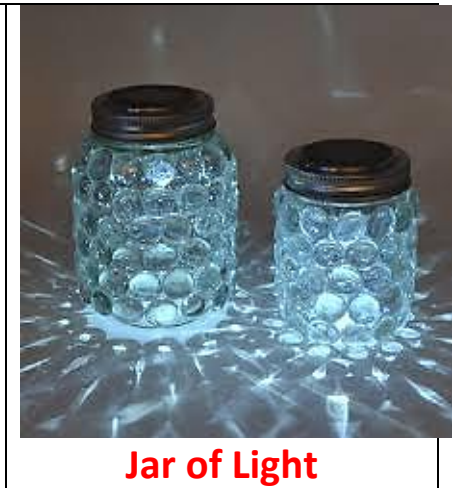
Jar of Light