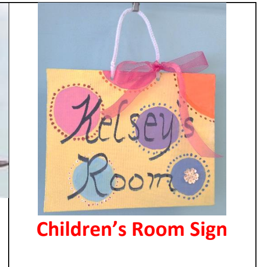
Children's Room Sign