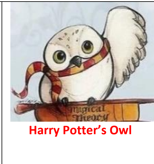
Harry Potter's Owl