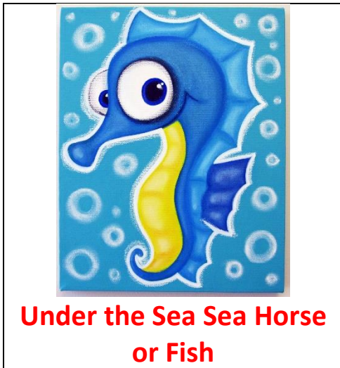
Under the Sea Sea Horse or Fish