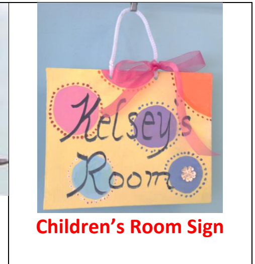
Children's Room Sign